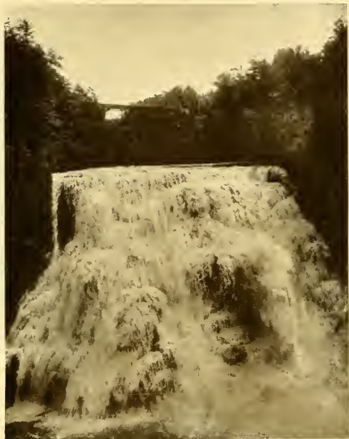
FALLS IN NORTH GORGE